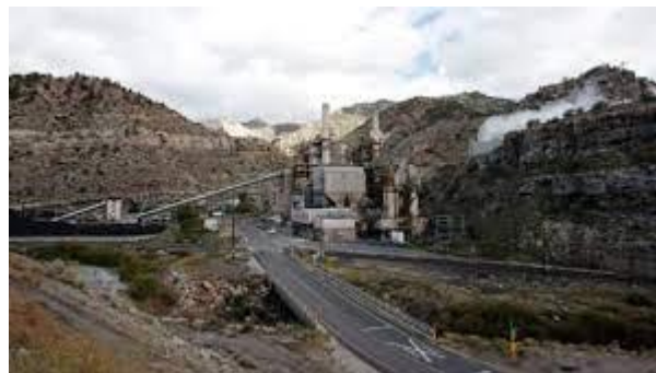
Carbon Power Plant, Utah's oldest coal-fired power plant, was taken offline in 2015.

There are certainly challenges and opportunities associated with converting coal plants to nuclear power. The biggest challenge is the cost and time to build new nuclear power plants, as well as the regulatory hurdles. Converting coal plants to nuclear power, however, could help retain work forces at coal plants and stabilize the economy, while helping the United States meet its climate goals. 🌍