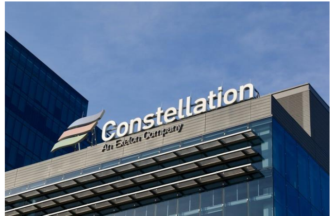
Constellation is the largest locally headquartered public company in Baltimore, Maryland.