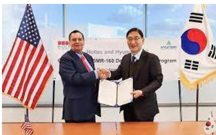
Hyundai & Holtec sign Teaming Agreement