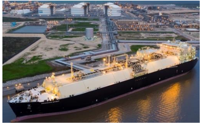
Sabine Pass LNG Terminal

In 2017, the US became a net exporter of natural gas ( LNG ) for the first time since 1957. The increase in LNG exports began when the Sabine Pass LNG Terminal ( pictured right ) came online in 2016. Today, during the first half of 2023 our LNG exports averaged 11.6 billion ft 3 /day, making the US the world's top LNG exporting country.