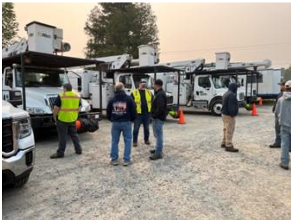
Treeways Vegetation Crew

L.D. began with an introduction to Treeways management about Human Performance, and how its connection with safety is so important in today's work environment. L.D. then provided classroom instruction followed by "in-the field" application with the vegetation