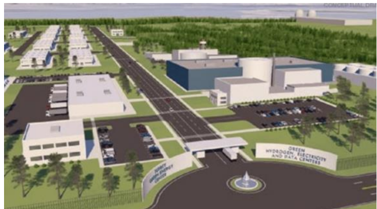
Artistic Conception of the Surry Green Energy Center

A solar power developer ( Green Energy Partners ) and a nuclear power developer ( IP3 International ) have formed a joint venture to develop an industrial park in Virginia ( 641 acres - adjacent to Dominion's Surry Nuclear Power Plant ) that will feature data centers powered by hydrogen gas generators and SMRs ( small modular reactors ). Four to six SMRs would provide energy for 20 to 30 data centers, along with generating hydrogen fuel, and providing backup power for the Virginia power grid.