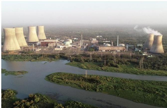
Kakrapar Atomic Power Station

India has finally begun commercial operation of their domestically designed pressurized heavy water reactor ( PHWR ) at the Kakrapar Atomic Power Station in Gujarat. Unit 3 is a 700 MWe nuclear power plant that did not begin its commercial operation until nearly 3 years after its initial criticality . Its twin unit, Unit 4, is in an advanced stage of commissioning and is scheduled for commercial operation in March 2024. India has a nuclear fleet of 17 PHWRs, two VVER PWRs ( pressurized water reactors ), with eight reactors under construction and planned for completion by 2027. Three of their nuclear plants are in suspended operation – two BWR's and one PHWR.