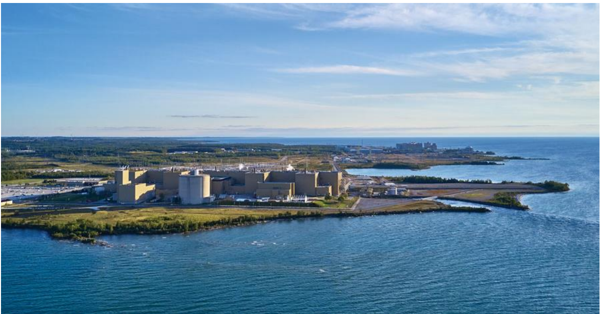
Bruce Power Station on the Eastern Shore of Lake Huron in Ontario, Canada

All of Japan's commercial reactors were shut down following the Fukushima disaster and are not allowed to restart until they have passed stringent new safety checks by the Japan's NRA ( Nuclear Regulation Authority ). Eleven of the 33 operable nuclear power plants have met post-Fukushima safety standards: Sendai -1&2, Genkai -3&4, Ikata -3, Mihama -3, Ohi -3&4 and Takahama -1,3, & 4. Ten nuclear power plants are still under examination by the NRA, and one of them, Takahama -2, is expected to meet all the post-Fukushima safety standards and become operational this month. 🌐